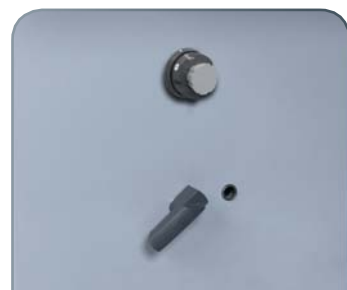
MxB + MC4