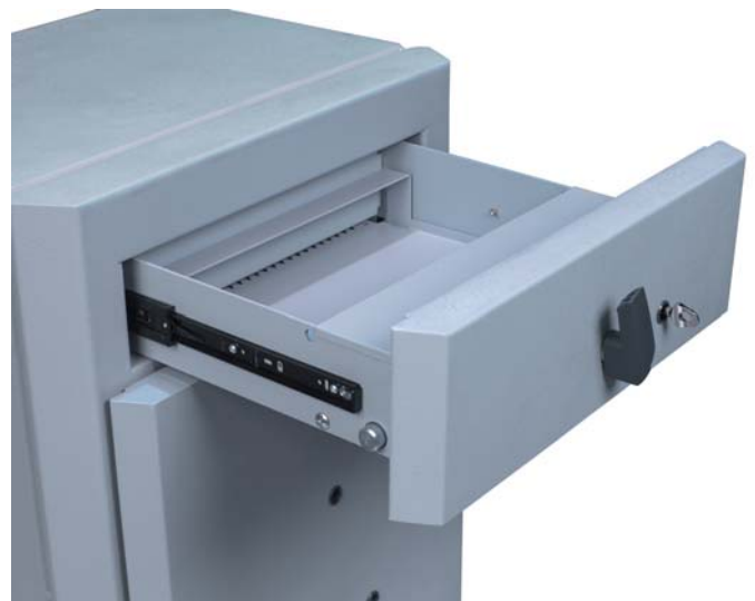
Millium Deposit Express has been designed for easy installation under a cash desk